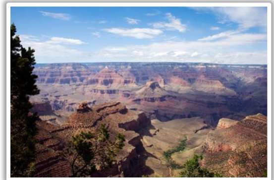
The Grand Canyon