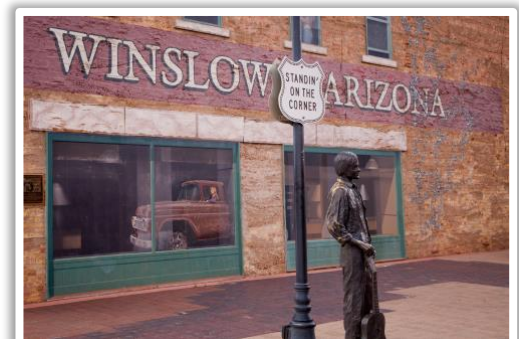
Standin on the Corner...